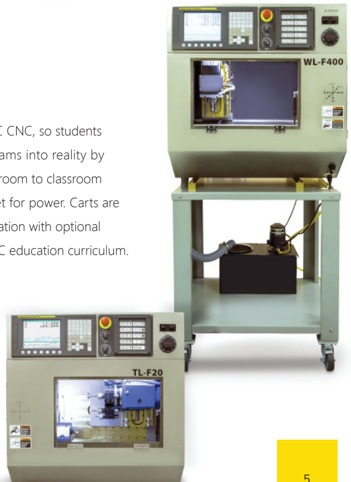
CNC Cert Cart

Tabletop CNC certification carts are portable machines with a FANUC CNC, so students can practice machine set up and operation, and bring their programs into reality by making parts. The certification carts can be easily moved from classroom to classroom through a standard doorway and require only a standard wall outlet for power. Carts are available in turning (lathe) configuration or machining (mill) configuration with optional tooling packages that correspond with the lab exercises in the FANUC education curriculum.